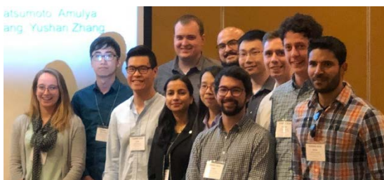
Recipients of Department of Energy (left) and National Science Foundation (right) fellowships

Overall, FOMMS 2018 was a great success. We are especially grateful to the Department of Energy, the National Science Foundation, and our other sponsors, whose generosity enabled us to award 26 graduate student fellowships that enabled people to attend the meeting who otherwise might not have been able to do so. Other sponsors were ExxonMobil, Solvay, the AIChE Computational Molecular Science and Engineering Forum, the American Chemical Society, Springer, The Dow Chemical Company Foundation, and the University of Minnesota.