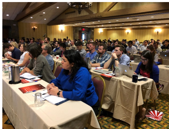
Participants at FOMMS 2018