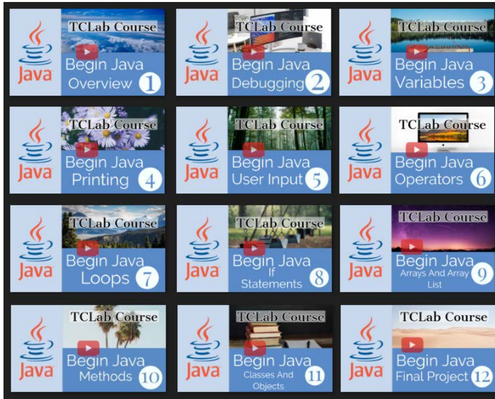
Figure B5. Begin Java Modules with Hands-On TCLab Exercises

In addition to the Begin Matlab course, a Begin Java and Begin Python course are published on YouTube and GitHub with the Java course shown in Figure B6.