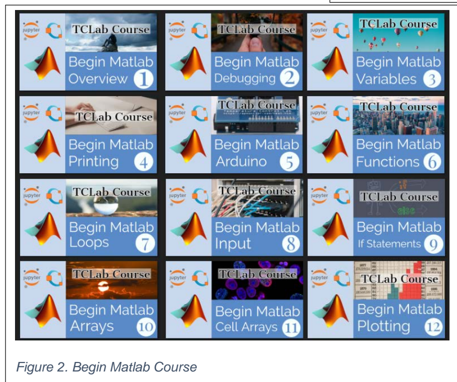
Figure 2. Begin Matlab Course

have experience translating process control theory into practice. Many universities have a process control lab to meet this need, but access to these labs is incompatible with new requirements for remote instruction or social distancing due to COVID-19. There are several strategies to provide a practical process control experience using simulators or home-based Arduino labs [2].