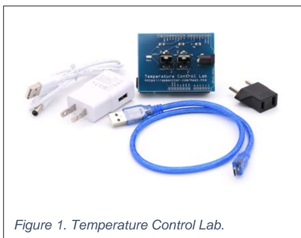
Figure 1. Temperature Control Lab.

The survey on Chemical Engineering Academia-Industry Alignment: Expectations about New Graduates [1] emphasizes the industrial need for students to have a practical understanding of system dynamics and process control. Graduates should