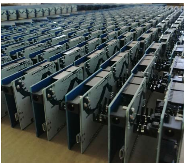
Figure 3. Production of the TCLab.

Desired characteristics of a take-home lab are safety, durability, small size, low cost, compatibility with all